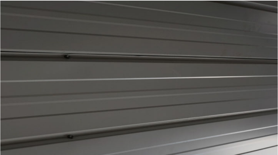
MS 750 I